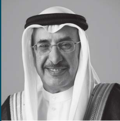
H.E. Shaikh Khalid bin Abdulla Al Khalifa Deputy Prime Minister Kingdom of Bahrain

We are pleased to invite you to participate in the Tenth Bahrain International Property Exhibition and Forum, BIPEX 2017, held under the patronage of H.E Shaikh Khalid Bin Abdulla Al Khalifa, Deputy Prime Minister, Kingdom of Bahrain.